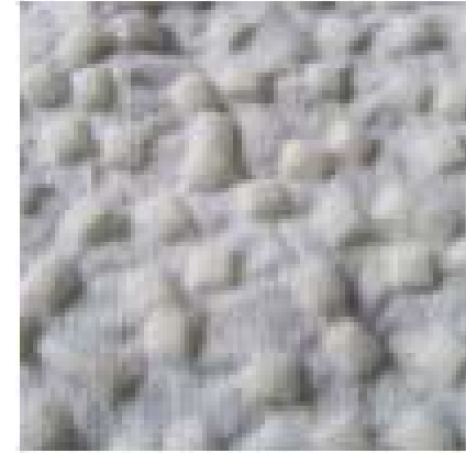
5 x 5 mm