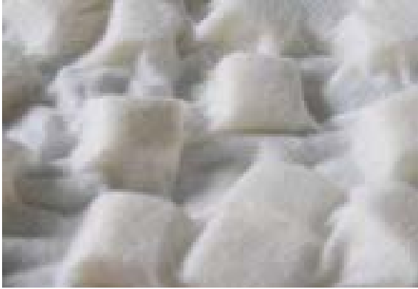
15 x 15 mm