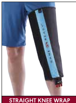
STRAIGHT KNEE WRAP