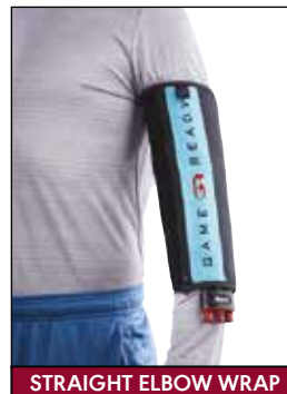
STRAIGHT ELBOW WRAP