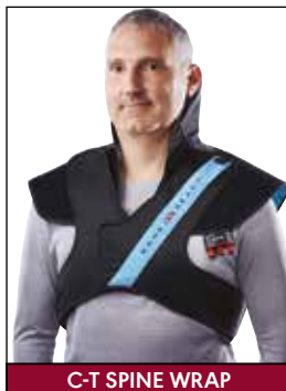
C-T SPINE WRAP

GAME READY's dual-action ATX® Wraps enable the simultaneous delivery of adjustable intermittent pneumatic compression and continuous cold or heat therapy throughout treatment.