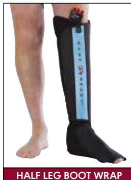
HALF LEG BOOT WRAP