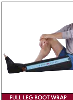
FULL LEG BOOT WRAP