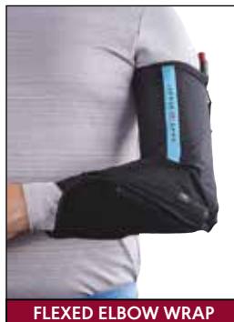
FLEXED ELBOW WRAP