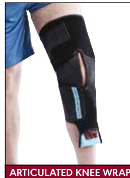
ARTICULATED KNEE WRAP